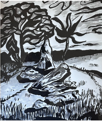
Menhir, St-Malo, Brittany