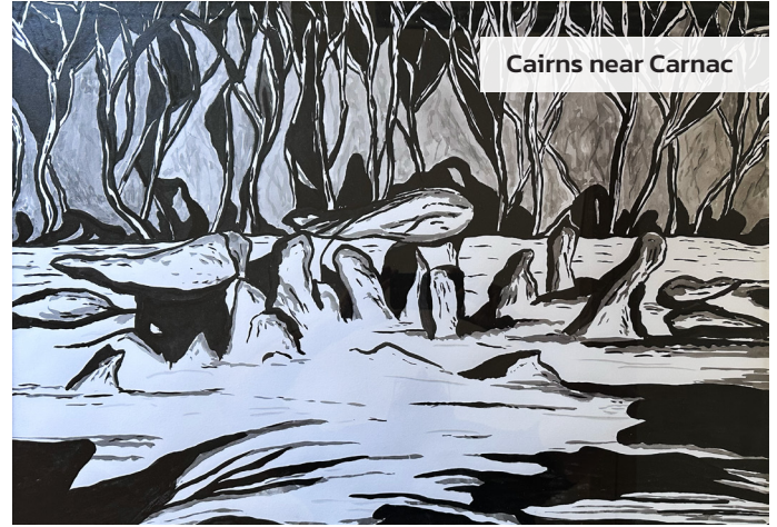
Cairns near Carnac