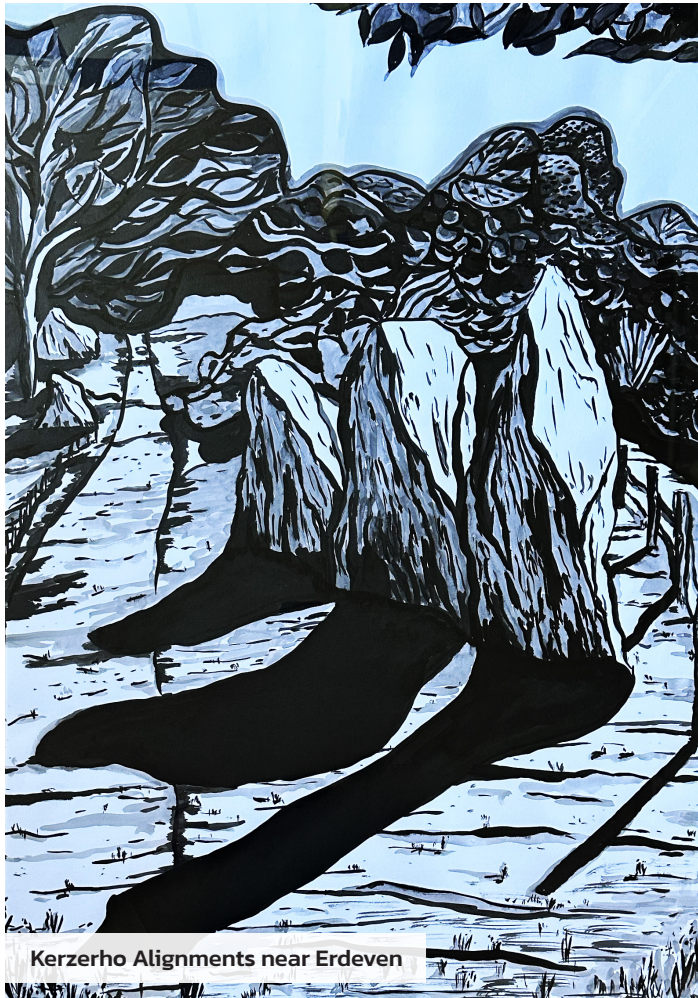
Kerzerho Alignments near Erdeven