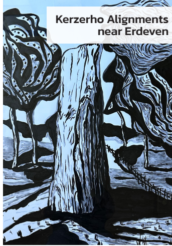
Kerzerho Alignments near Erdeven