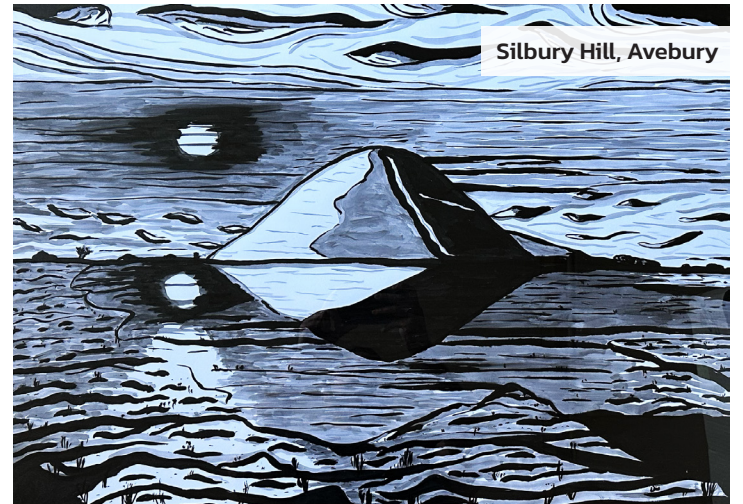
Silbury Hill, Avebury