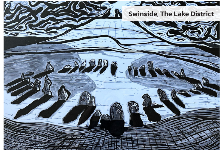
Swinside, The Lake District

Visitors often describe it exactly as "a massive stone resting on two uprights." According to antiquarian records, additional stones once surrounded it, but today the striking feature is the huge capstone and its two supports.