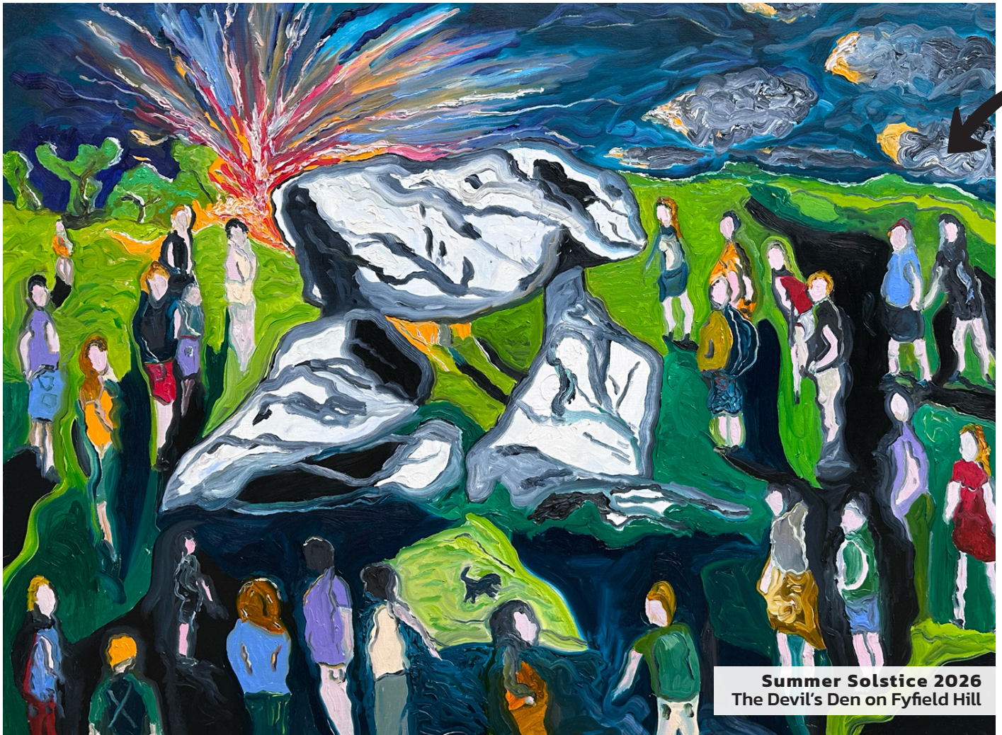
Summer Solstice 2026 The Devil's Den on Fyfield Hill