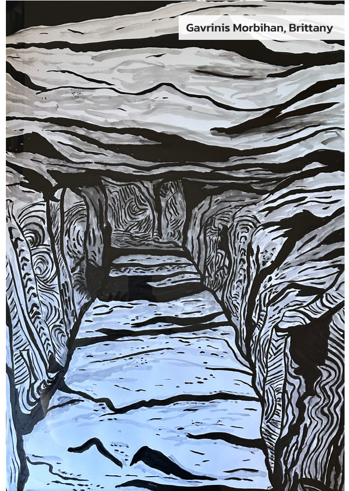
Gavrinis Morbihan, Brittany