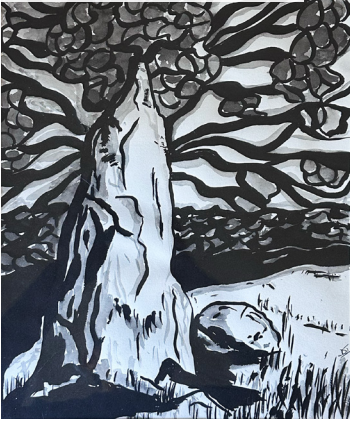
Menhir, St-Malo, Brittany